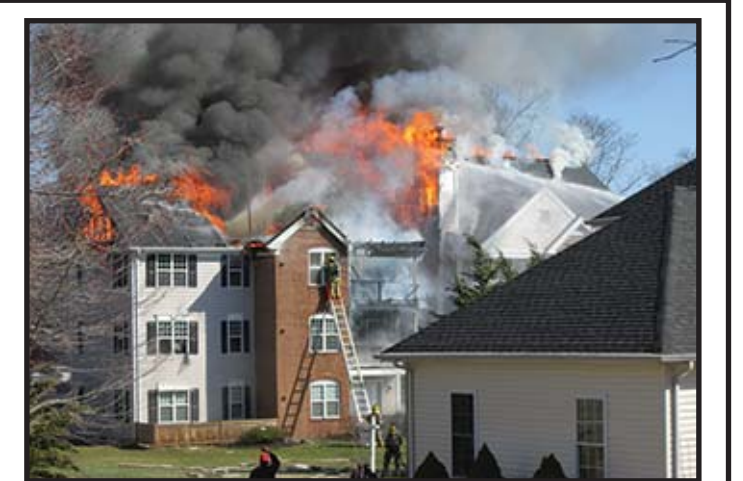
Fairfax County and Fairfax City firefighters battle a large garden apartment fire March 3, 2014, on Bob Court in the City of Fairfax. Units from Merrifield, Oakton, and Fairfax Center assisted in fighting the fire.