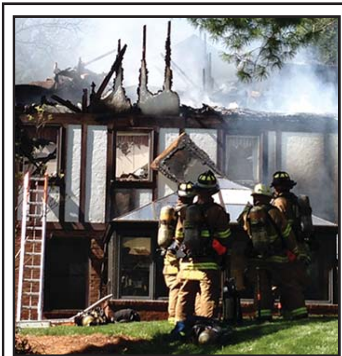
Firefighters responded to a two-story house fire with heavy fire showing from the attic and roof, April 21, 2014, at 1712 Abbey Oak Drive, Vienna. No one was home when the fire broke out. Damage was estimated at $300,000 and is under investigation.