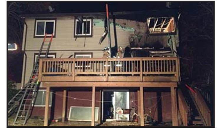
Firefighters responded to a house fire March 23, 2014, at 5338 Jennifer Drive in the Fairview area. All six occupants escaped unharmed prior to units arriving on scene. Improperly discarded smoking materials on the rear deck caused an estimated $50,000 in damages.