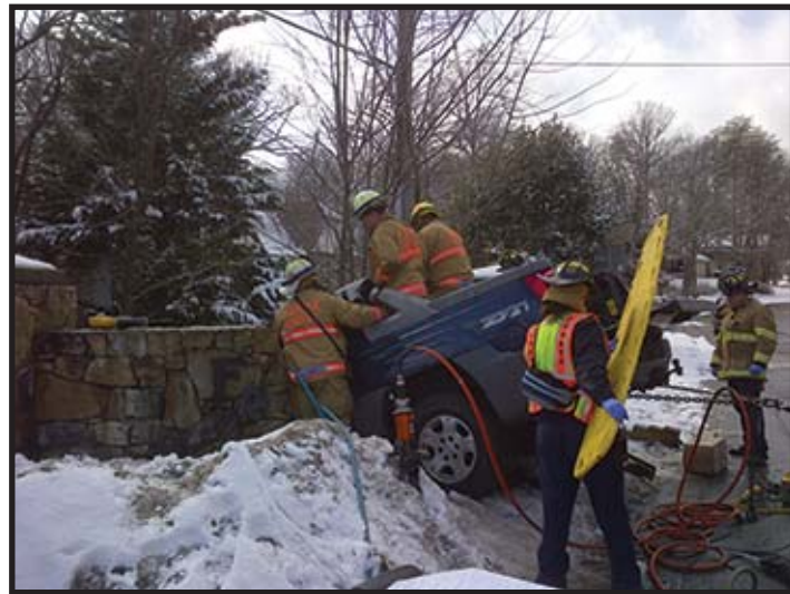
Crews from the 7th Battalion responded to a major vehicle crash March 4, 2014, at Ox Road and Robert Carter Drive. One patient was extricated and then transported with life-threatening injuries to INOVA Fairfax Hospital.