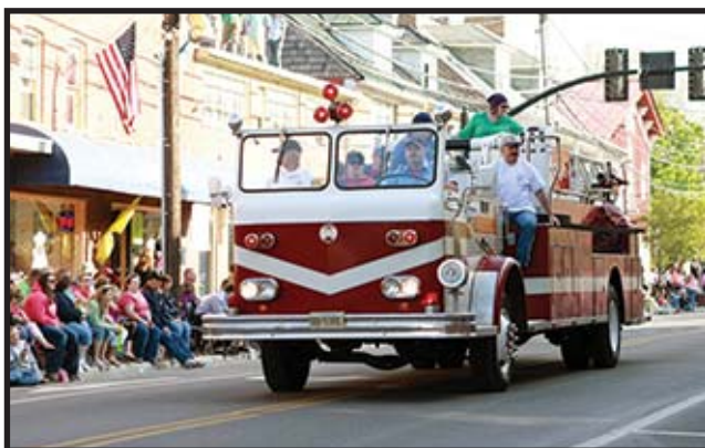
Several Fairfax County Fire and Rescue Department retirees ride in an "antique Maxim ladder truck" in the Winchester Apple Blossom Firefighters' Parade, Friday, May 2, 2014.