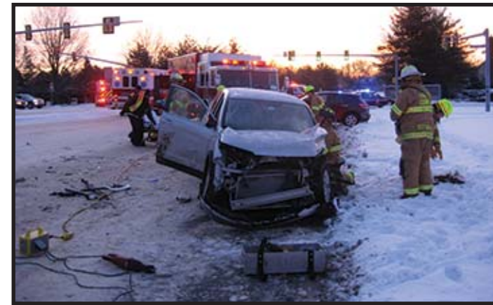
Firefighters from the 7th Battalion responded to a major vehicle accident at the Fairfax County Parkway and Huntsman Boulevard February 25, 2014, during inclement weather. After a lengthy extrication, both occupants were transported with non-life threatening injuries.