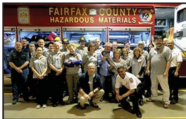
The third iteration of the Citizens Fire and Rescue Academy spent the evening learning about hazardous materials and about the responsibilities of the safety officer, April 24, 2014, at Fire and Rescue Station 40, Fairfax Center.