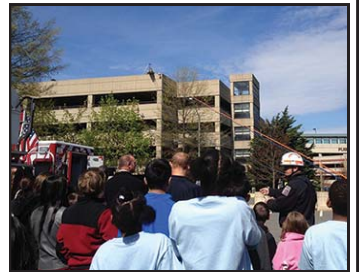
Several dozen children participated in the consolidated Public Safety "Bring Your Kids to Work Day" event, April 24, 2014. Kids were exposed to a multitude of interesting demonstrations. The half-day was capped off with lunch and participation certificates.