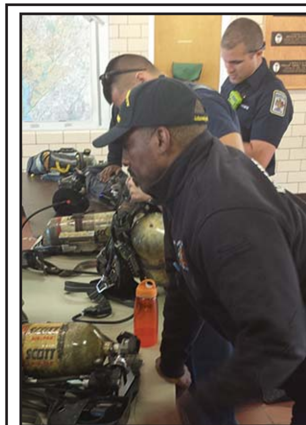
Units from Fairfax County, Arlington County, and City of Alexandria meet at the quarters of Engine 206 to discuss lessons learned following a multi-company drill, and to compare the differences in their various SCOTT breathing apparatus and different RIT packs, April 27, 2014.