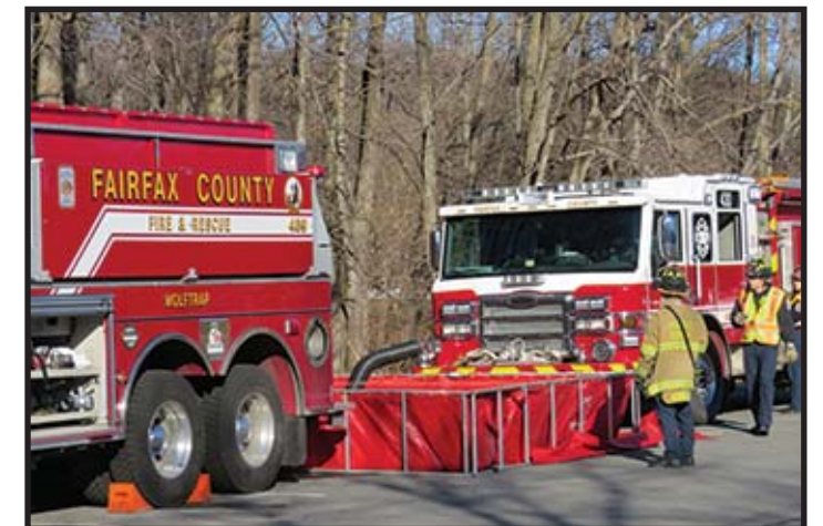
Crews from Fire and Rescue Station 11, Penn Daw, 28, Seven Corners, 30, Merrifield, 12, Great Falls, and 39, North Point, participate in a rural area water supply training scenario, including the collection, drafting, and shuttling of water to another site. The operation was conducted February 22, 2014, at Wolf Trap Park and is part of the testing for Insurance Services Office, Inc. One of the requirements of the ISO testing is for the water source to be more than 1,000 feet away and be performed without laying a supply line from the water source.