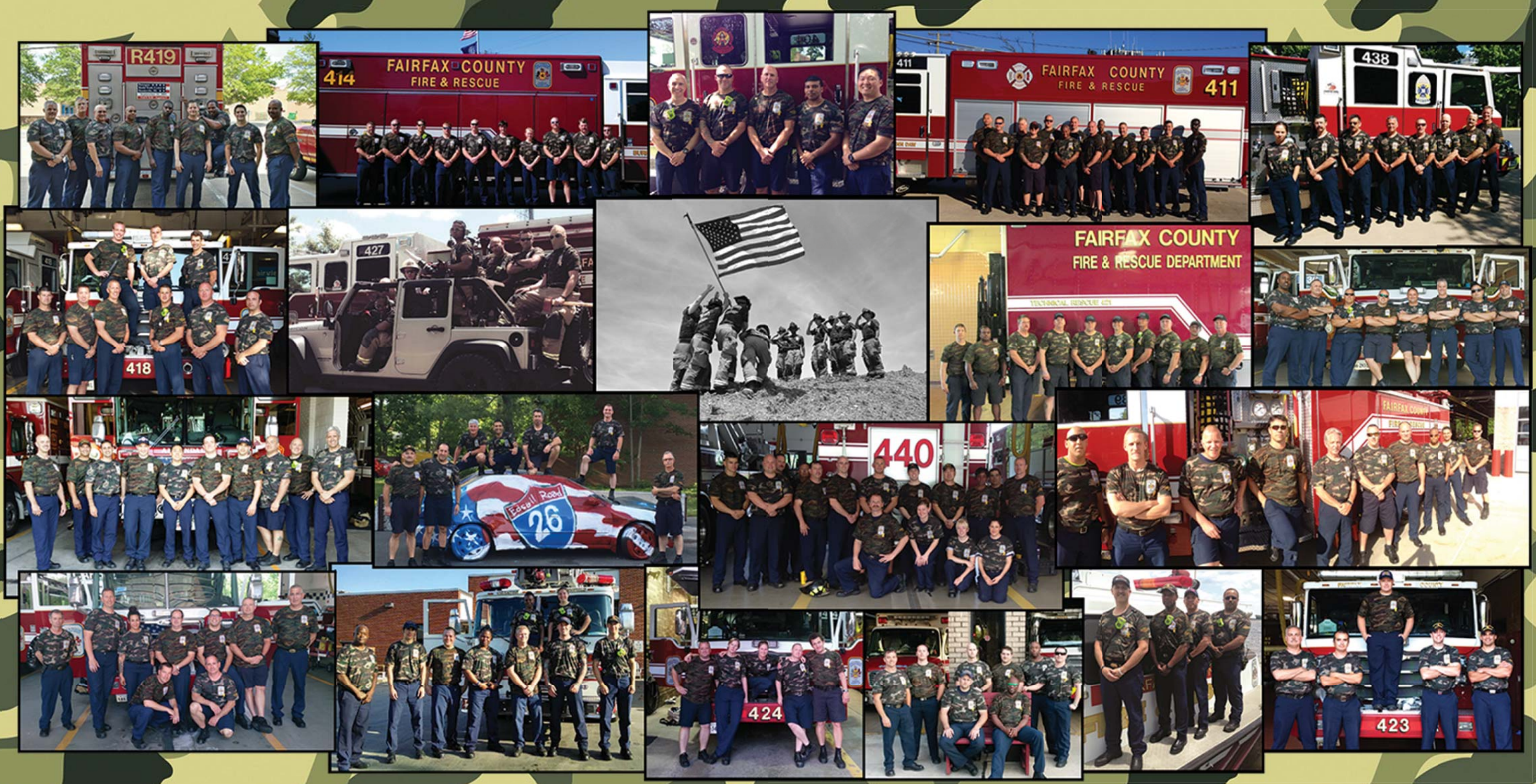
Firefighters wear camouflage t-shirts to pay tribute to those who paid the ultimate sacrifice in the service of their Nation, May 23 -28. Firefighters honored all military who gave their lives for our freedom and the freedoms of others. Our humble salute provides us the opportunity to say thank you from a "grateful department."