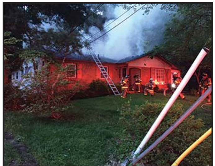
Firefighters responded to an Annandale house fire, July 11, 2015. Two adults were displaced. The cause of the fire was an unidentified electrical event in the attic.