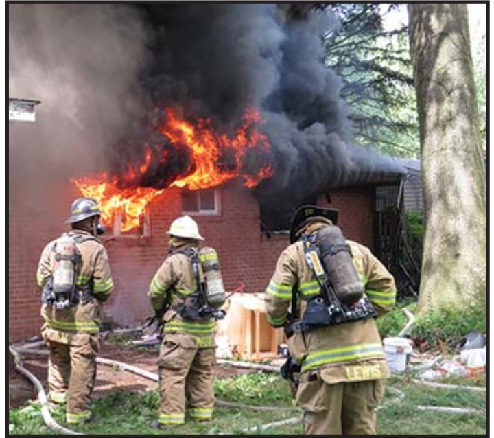
Firefighters from Fire and Rescue Station 14, Burke, Fire and Rescue Station 41, Crosspointe, and the Academy participate in a live-fire burn, June 22, 2015, at 1202 Drake Street, Vienna.