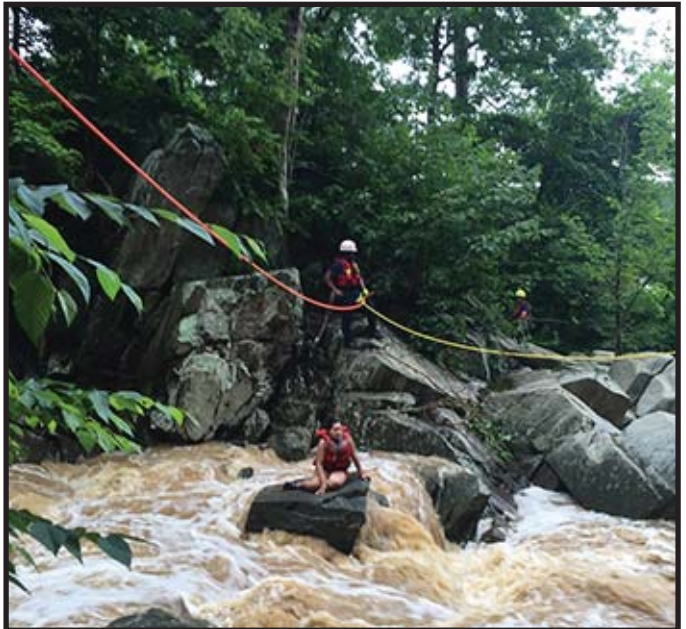
Firefighters from McLean, Jefferson, and Great Falls rescued an adult female at Scott's Run Nature Preserve after quickly rising water dangerously stranded her on a rock.