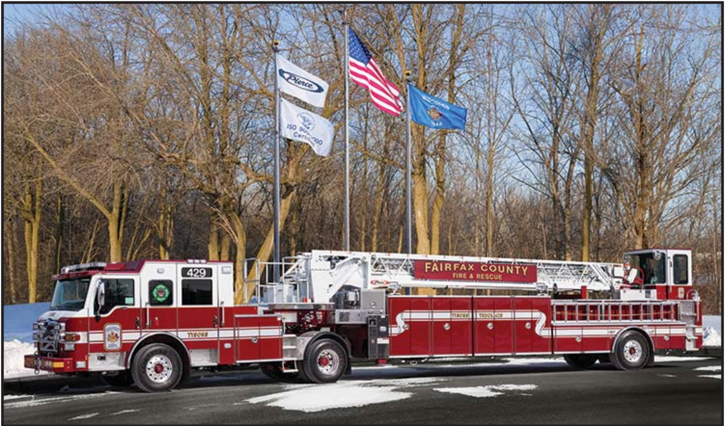
Tiller Truck 429 went into service at Fire and Rescue Station 29, Tysons, July 27, 2015 at 7 a.m. The 100-foot Pierce (Tractor Drawn Aerial) TDA truck will allow the department to better match the apparatus and equipment to the response environment in the Tysons area.