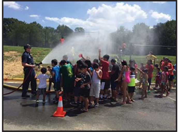
Firefighters from Fire and Rescue Station 22, A-Shift, mix it up with children using hose lines during summer camp on a hot, summer day, July 31, 2015.