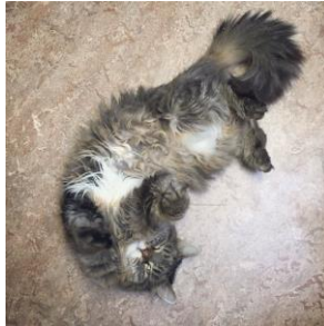
Farrah in her office.

Usually, it takes only a few days in an office for stressed cats to feel much more relaxed and show their true individual personalities—which helps them become ready for adoption! Sometimes it's the office humans who introduce office cats to potential adopters, since they often know them best, having spent so much quality time with them. All available Office Cats have their photo and bio displayed in the main Cat Adoption Area and on our Petango page, and regular adoption process and requirements apply.