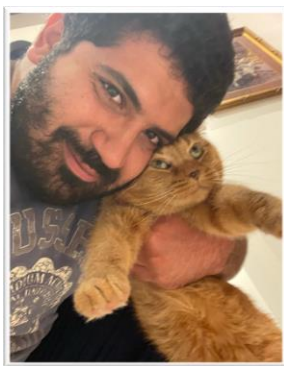
George, after being reunited with his owner.

Many pets come to us as strays. Our staff do an amazing job of using whatever clues a pet comes in with to reunite them with their family, but unfortunately many pets come to us with no identification or microchip which makes that process very difficult and, in some cases, impossible.