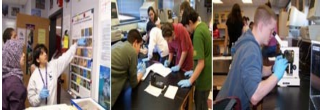
FCPS High School Students Participate in Sewer Science Lab