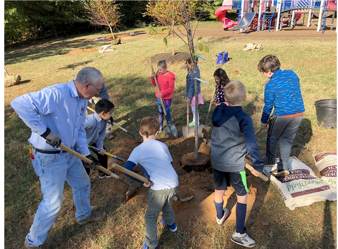
Mantua ES Students, Urban Forestry Manager Plant Native Trees on Campus