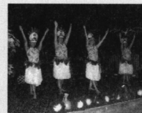
HAWAIIAN CULTURAL HERITAGE NIGHT