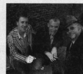
RHODES TAVERN TROUBADOURS