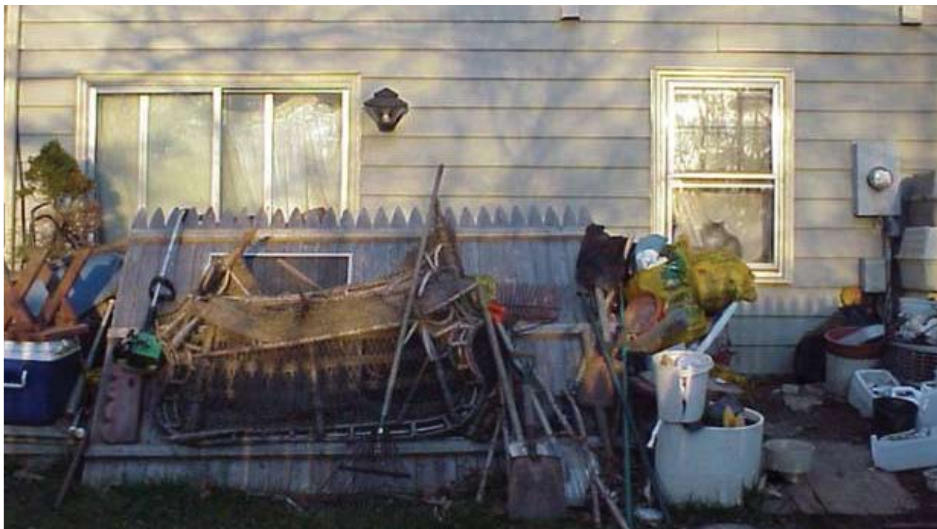
Back of House, Blocked Egress