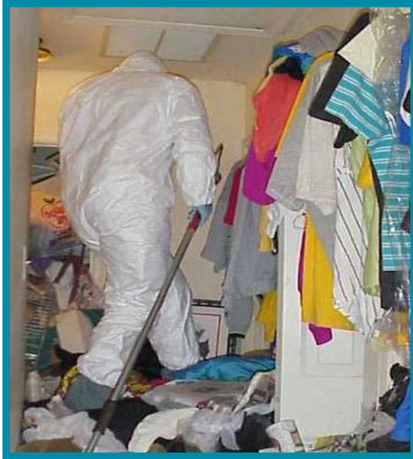
Inspector atop debris