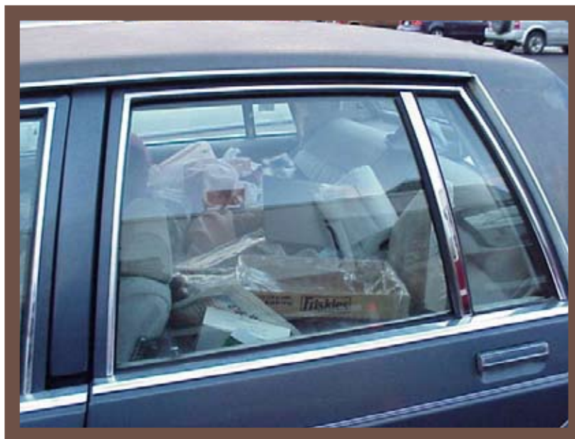
Sign of potential hoarding