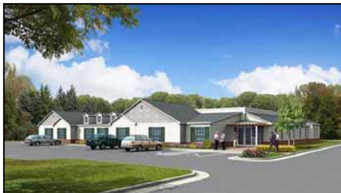
Artist rendering of the Gregory Drive Facility to accommodate the therapeutic mental health and substance abuse program for County residents, planned to be completed by summer 2009. This planned project is supported by General Obligation bonds approved as part of the fall 2004 Human Services/Juvenile Facilities Bond Referendum.

An increase of $571,038 is included to continue ongoing efforts to address timely access and manageable caseloads for Mental Health adult outpatient services. Funding will ensure that access and caseload standards can be met by maintaining current clinical capacity, continuing retiree and Exempt Limited Term employee options and utilization of the County's workforce planning strategies. This action is intended as a temporary action while awaiting the Board-appointed Beeman Commission proposals and recommendations to improve the County's mental health services delivery systems. In addition, efforts are underway to streamline the processes by which services are accessed and to address caseloads through program redesigns.