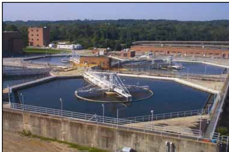
Photo of the Noman M. Cole Jr. Pollution Control Plant for wastewater treatment.

Changes to the FY 2009 Sewer Service Charge and Availability Fee are based on increased costs associated with capital project construction, system operation and maintenance, debt service and upgrades to reduce nitrogen discharge from wastewater in order to meet more stringent environmental regulations.