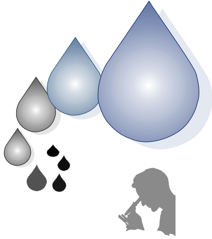
Fairfax County's Environmental Monitoring Branch