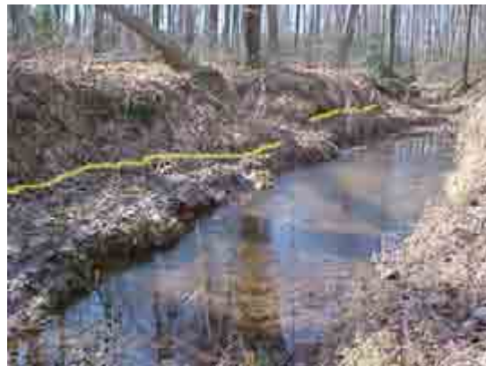
Figure 2: Examples of bank-full elevation (bench) in a second order, perennial stream.