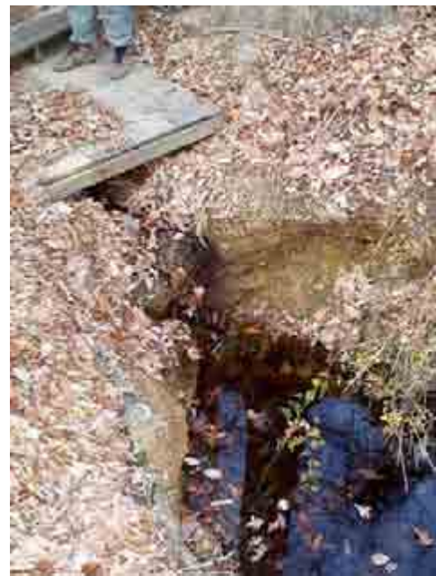
Figure 1: Example of a headcut where perennial stream flow begins.