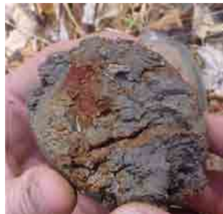
Figure 3: Iron oxidized mottling of a gleyed soil matrix.