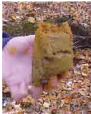
Figure 4: A high chroma soil matrix