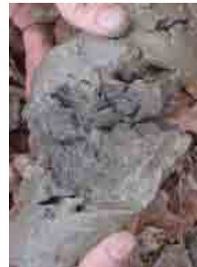
Figure 5: Completely gleyed, low-chroma soil matrix.