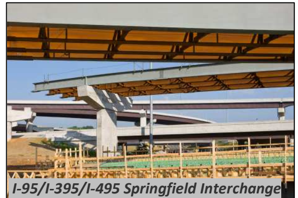
I-95/I-395/I-495 Springfield Interchange

Most of the steel and deck bridge structures were completed in 2010. All of the bridge work for the Springfield Interchange is scheduled to be completed by the end 2011.