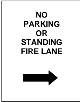
SIGN TYPE "A"

Standard wording with an arrow on the bottom pointing to the right. One sign mounted parallel to the line of curbing or pavement edge at the end of the painted area.