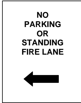
SIGN TYPE "C"

Standard wording with an arrow on the bottom pointing to the left. One sign mounted parallel to the line of curbing or pavement edge at the end of the painted area.