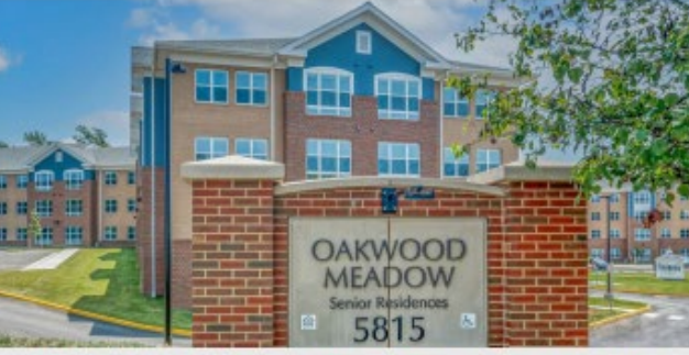
Oakwood Senior Apartments 150 Senior Apartments