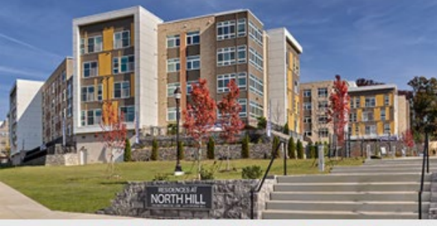
Residences at North Hill 279 Units