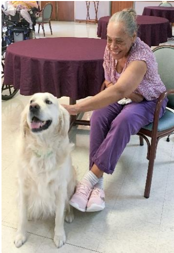
Birmingham Green's Eden Alternative journey is stomping out Boredom, Loneliness and Helplessness (BLAHs).