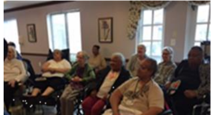
Resident Empowerment Group