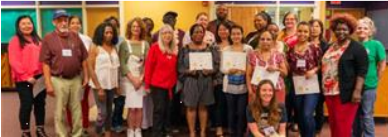
Birmingham Green team members complete Eden Alternative training