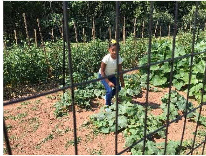
Lyric's Garden, is a pop-up garden on campus inspired by a grade school student, that feeds the homeless and those hungry in the community.