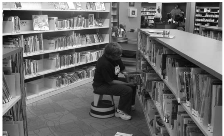
A volunteer shelves books at Burke Centre Library at VolunteerFest 2008.

Description: The Sherwood Regional Library is in need of a few good shelf readers! Volunteers are needed to put books in the correct order on the shelves. There are plenty of collections for volunteers to work on based on individual interest. Minimum age with adult supervision: any; without: 15.