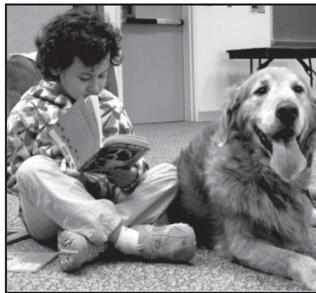
Kodi listens to a young reader at a Read to the Dog program at Pohick Regional Library.