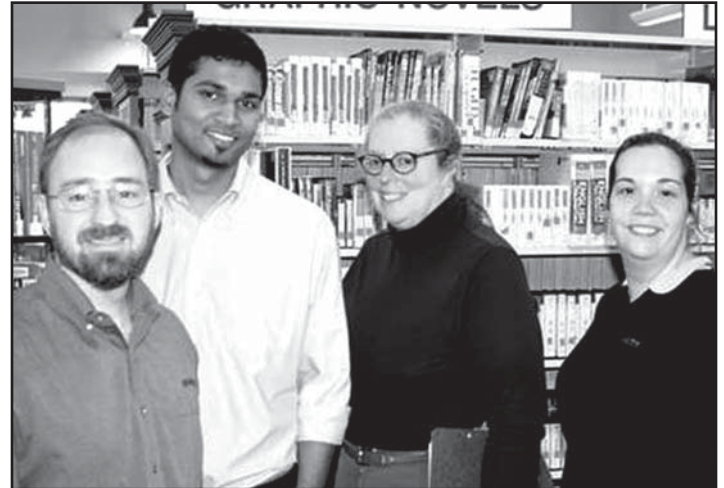
Datatel volunteers at the City of Fairfax Regional Library.

This experience benefited local library branches, but also had some side benefits. One of Datatel's volunteers signed up for a library card while she was there and another enjoyed this so much he plans on doing additional volunteer work on a regular basis.