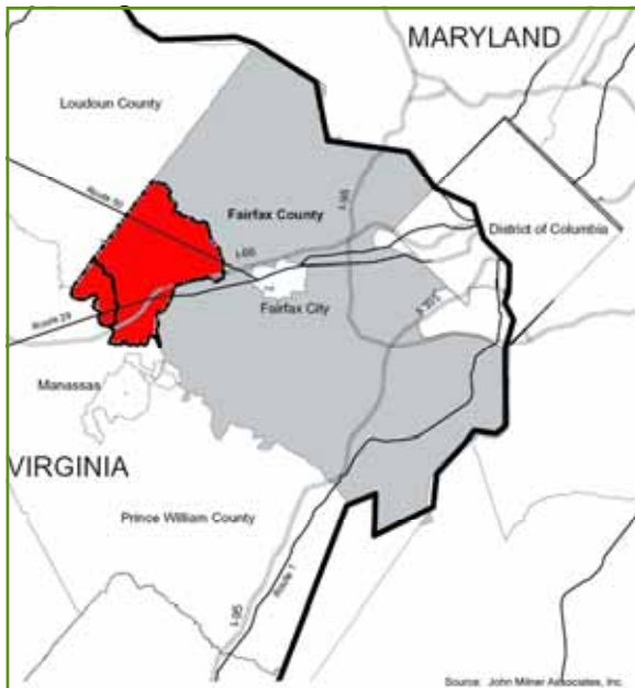
Project Area Location

In recent years, the Park Authority has acquired over 2,000 acres of new parkland in the western portion of the County. These acquisitions have occurred through a variety of conveyance mechanisms including purchases, developer dedications, state grants, and land transfers. This significant assemblage of parkland contains some of the richest natural, cultural, and scenic resources in the County, while also creating opportunities to help meet the wide variety of ever-increasing recreational needs.