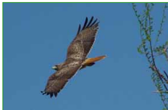
Red-tailed hawk found in Sully Woodlands

Wetlands in the project area fall within areas of alluvial and hydric soils. The vast majority of identified wetlands are palustrine or riverine deciduous forest wetlands that are flooded for part of the year. A few upland depressional swamps, a plant community described above, are found in the western part of the project area.