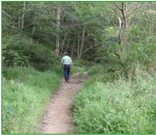
Natural Surface Trail

The principle of connectivity provides the backbone for developing a park system in Sully Woodlands, physically and conceptually tying together the elements of stewardship, recreation, and education and interpretation. Sully Woodlands consists both of large, contiguous areas of parkland and a scattered array of smaller parks and stream valley corridors. All of these sites can be connected through a greenway/habitat corridor network and a non-motorized transportation network to develop a functioning park system in Sully Woodlands.