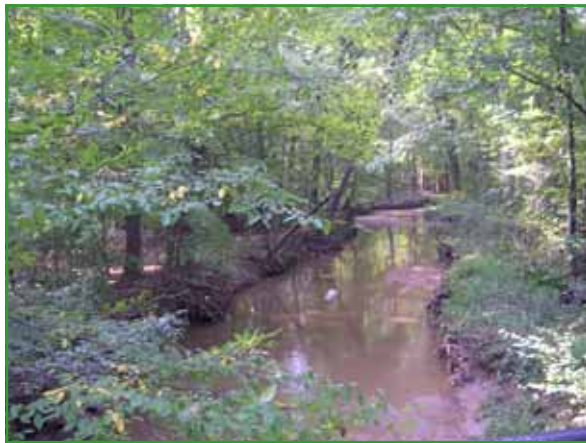
Rocky Run Stream Valley