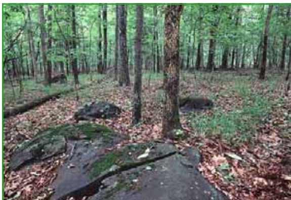
Basic Oak-Hickory Forest

Basic Oak-Hickory Forest is a mature forest community that occurs on diabase soils. The mildly acidic circumneutral soils with high levels of base saturation result in this globally rare plant community only found in parts of Northern Virginia and Southern Maryland. Oak and hickory are the dominant canopy trees, while the shrub layer includes dogwood, redbud, viburnum, pawpaw, and blueberry. Rare and endangered plants are found in this context, and relatively few invasive species are present.