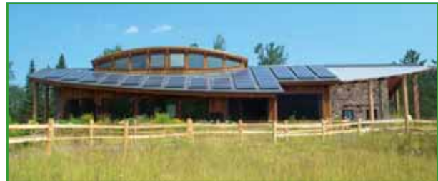
Example of Interpretive Center