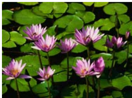
Water lilies grow on our ponds at Pinecrest.