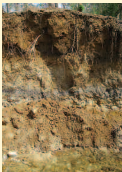
A cross section view of the soil at a stream bank shows a rainbow of layers composed of different organic and mineral materials deposited over time.

Soil is very special stuff. It can take hundreds of thousands of years to make good soil! But how is soil created? Weathering rock and decaying organic matter break into smaller and smaller bits with the help of wind, rain and wildlife, especially worms, until finally soil is formed. Layers of leaves and needles found in forests help protect the soil.