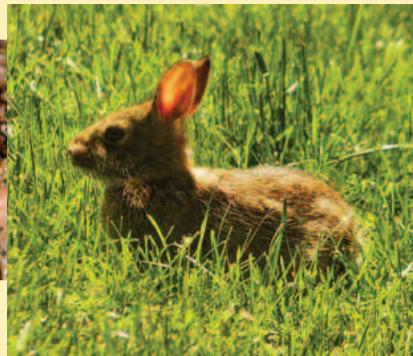
Eastern Cottontail Rabbit