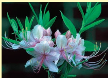
Tom Barnes, University of Kentucky

All azaleas are derived from native stock, and can withstand the windy conditions next to air conditioners, but the pinksterbloom azalea is a plant that can also be found in local woodlands.