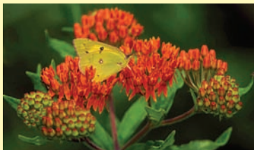
Tom Barnes, University of Kentucky

Butterfly weed , an easy plant with a long bloom, readily adapts to dry summer soil and can be used to soften the edges of a square sidewalk or patio.