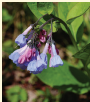
Virginia bluebells, aka oysterleaf.

Although pollen remained largely ignored by humankind throughout history, flowers were not. A not-so-secret code based on flowers was developed to communicate thoughts of encouragement, friendship and passion. Red roses signify love, whereas bluets signify innocence, and ragweed, well, that signifies hayfever. The common names of our most common wildflowers offer an intriguing glimpse into our past: fairy radish (spring beauty), Quaker ladies (those bluets again) and oysterleaf (Virginia bluebells). Some reflect the timing of flowering (shadbush for when the shad run in the streams) or where they grow (swamp milkweed is found in wet places). Common names can be strangely disappointing (New England aster) or at least unhelpful (common anything!) But whether their names are known or unknown, flowers speak a language of beauty and scent.