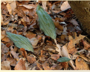
Crane fly orchid (leaves)