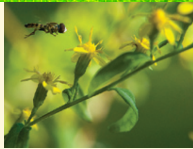
A pollinator wings its way to a wreath goldenrod flower to compete its important duty.

The same characteristics that lure pollinators to flowers lure people to admire and plant some of the finest wildflowers in yards and gardens. However, humans are just an afterthought in this process. Some plants spread their pollen without the assistance of pollinators. Plants with plain flowers, such as ragweed and grasses, expend their energy producing lots of pollen, relying on the wind to carry pollen to other flowers. Unfortunately, it's also carried to our noses and eyes.