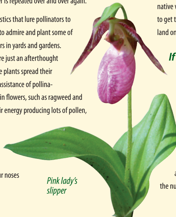
Pink lady's slipper

Protect the pollinators. Consider providing a water dish for butterflies to "puddle" in. Or a "nest box" for bees. Read about and implement the simple things you can do to increase the number of beneficial insects in your yard. You'll have more flowers.