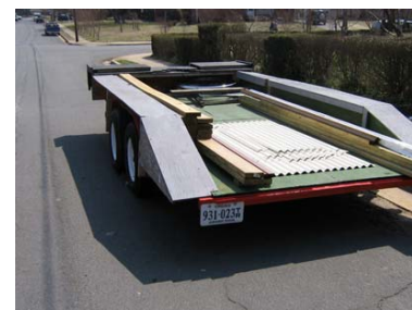
Utility Trailer with two or more axles