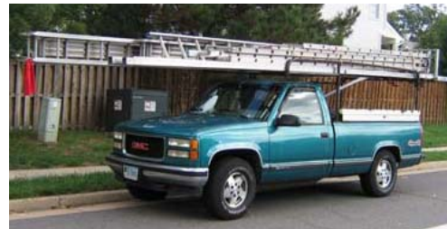
Cargo Trailer Over 21 feet in length including appurtenances

Another change to the code clarifies enforcement on service roads that abut residential areas. The entire service roadway which abuts a residentially zoned area shall be deemed residential for the purposes of enforcement.