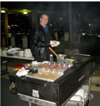
Carrabba's grilling for the Midnight Shift.

We would like to say an extra special thank you to Carrabba's Italian Grill for the grilled steak dinner served to the Midnights shift. The officers were very appreciative and very full when the meal was complete.