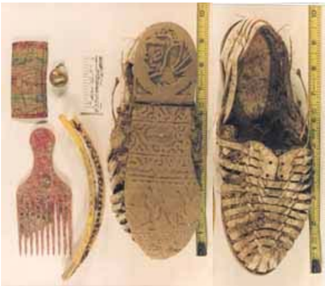
Items recovered with skeletal remains. Top row left to right: Lifesavers tag, earring, shoe (bottom view), shoe (top view). Bottom row left to right: hair pick, hair clip

If you wish to read more about this case, information has been posted on The Doe Network: Case File 120UFVA ( http://www.doenetwork.org/cases/120ufva.html )