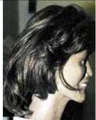
Clay reconstruction interpretation of victim- Side profile view