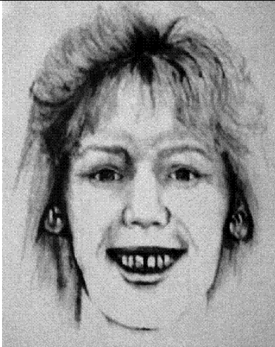
Sketch artist's interpretation of victim