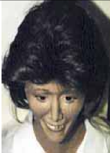
Clay reconstruction interpretation of victim- Front view