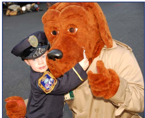
McGruff is embraced by a junior officer.

National Night Out events are designed to heighten awareness of crime and drug prevention, generate support for and participation in local anti-crime efforts, strengthen neighborhood spirit and police-community partnerships and send a message to criminals that neighborhoods are organized and won't tolerate criminal activity.