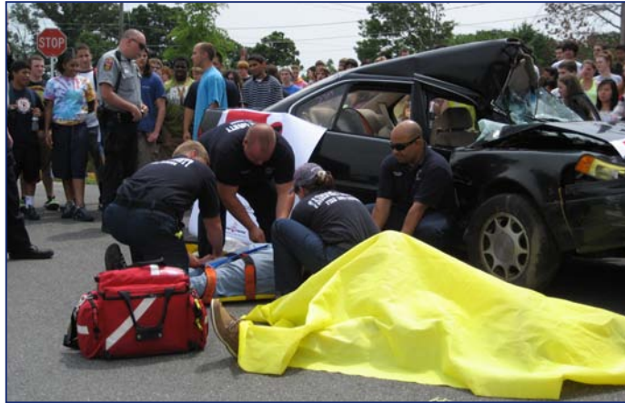
West Springfield High School students observe a mock DUI accident. West Springfield District Station officers with the help of Fire Station 27, conducted the event that included a fatality and ultimate arrest of a juvenile driver.