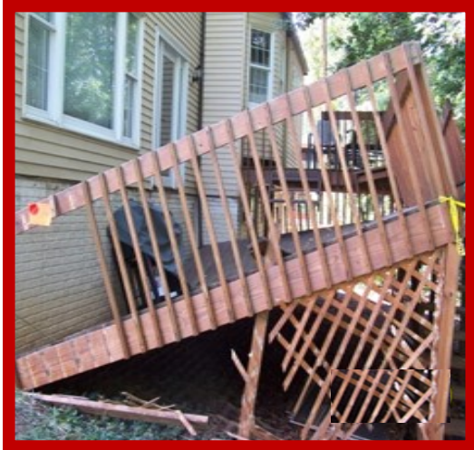
Improperly anchored deck