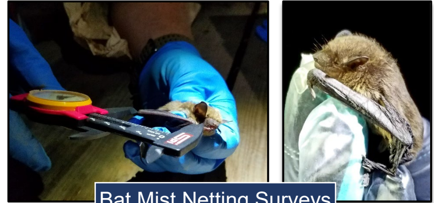
Bat Mist Netting Surveys