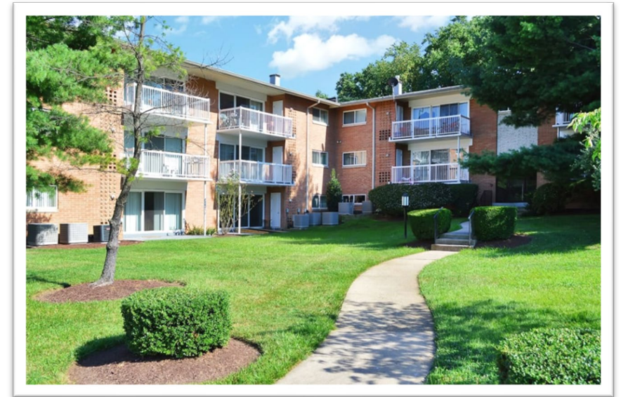
Coralain Gardens: Mason District