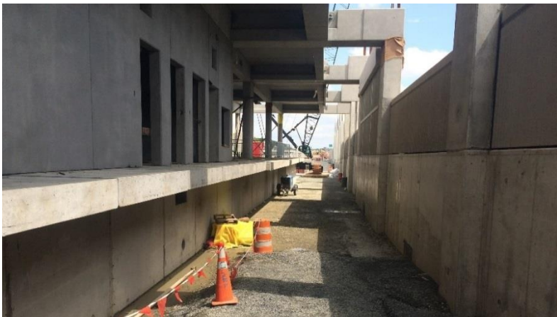
Unfinished platform and interior station wall