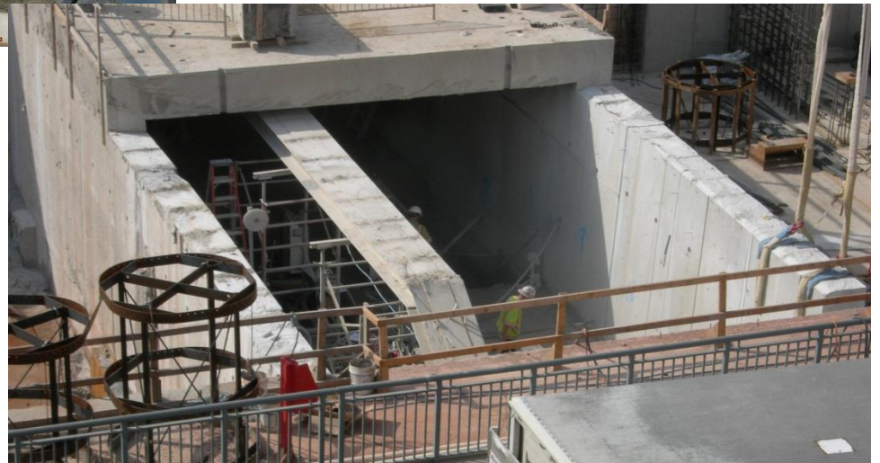
Pedestrian Tunnel to Terminal