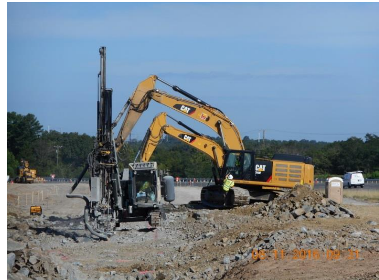
Site Preparation at Loudoun Gateway