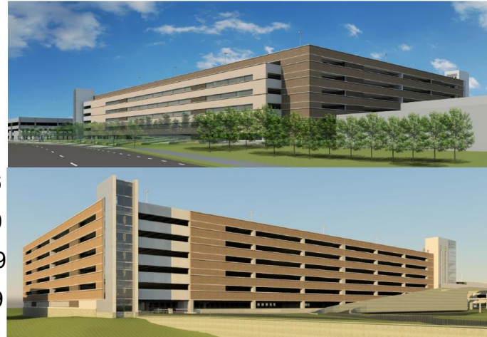
Sunrise Valley Drive - looking West