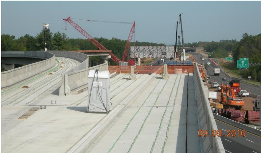
Aerial Guideway and Yard Lead