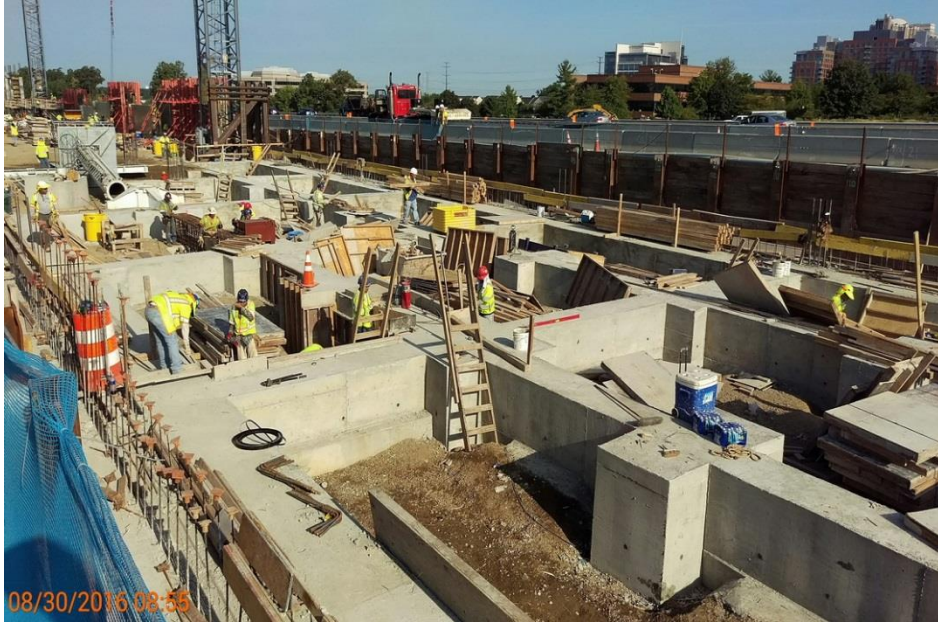
Station Foundation Tubs