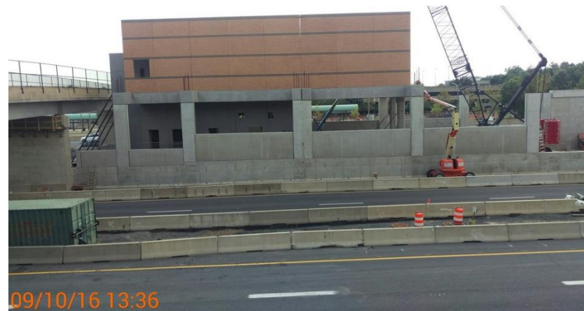
Station Wall Panels and Exterior