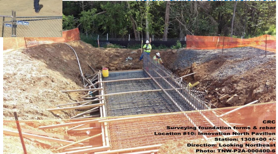
North Pavilion Foundation Work