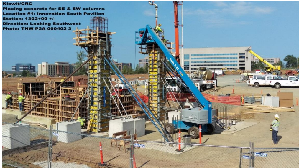
South Pavilion Piers and Foundation