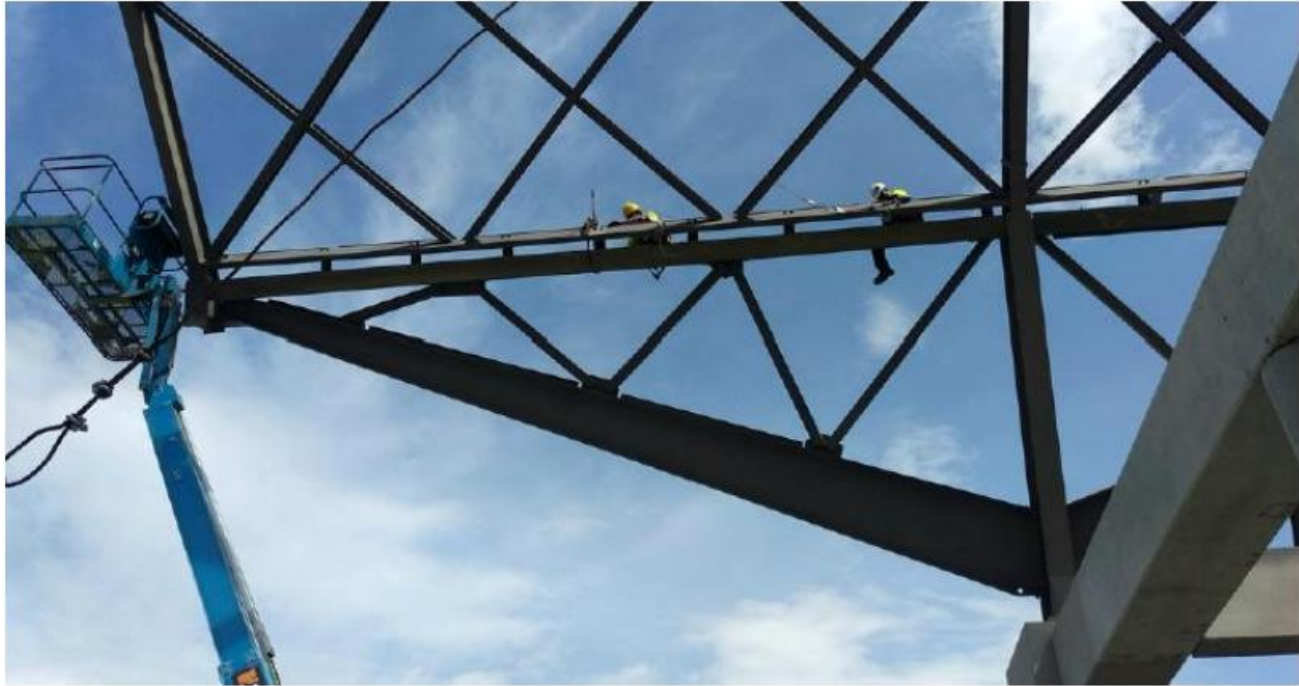
Ironworkers Detailing Structural Steel at Herndon Station