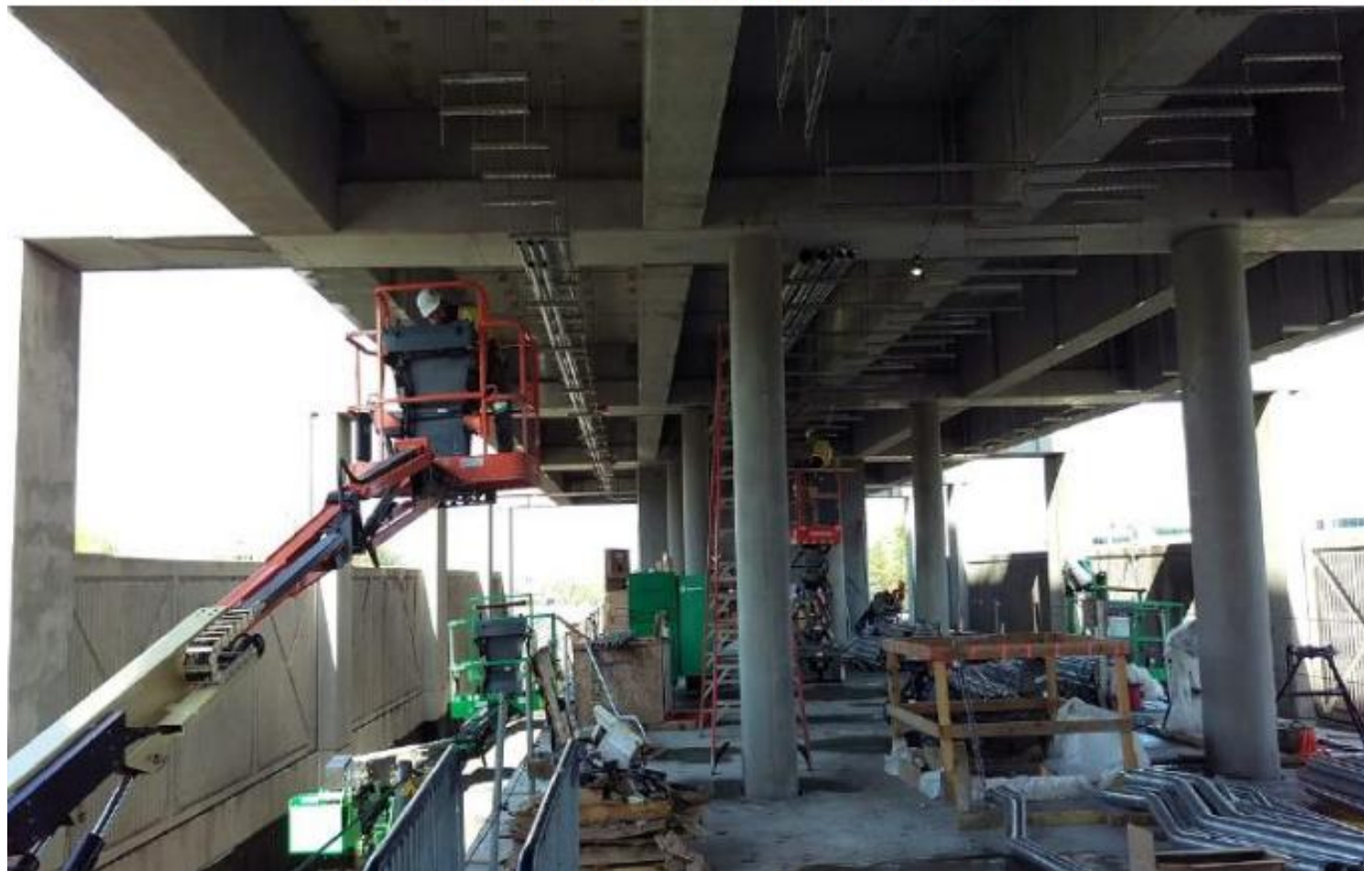
Electrical Rough In at Reston Station