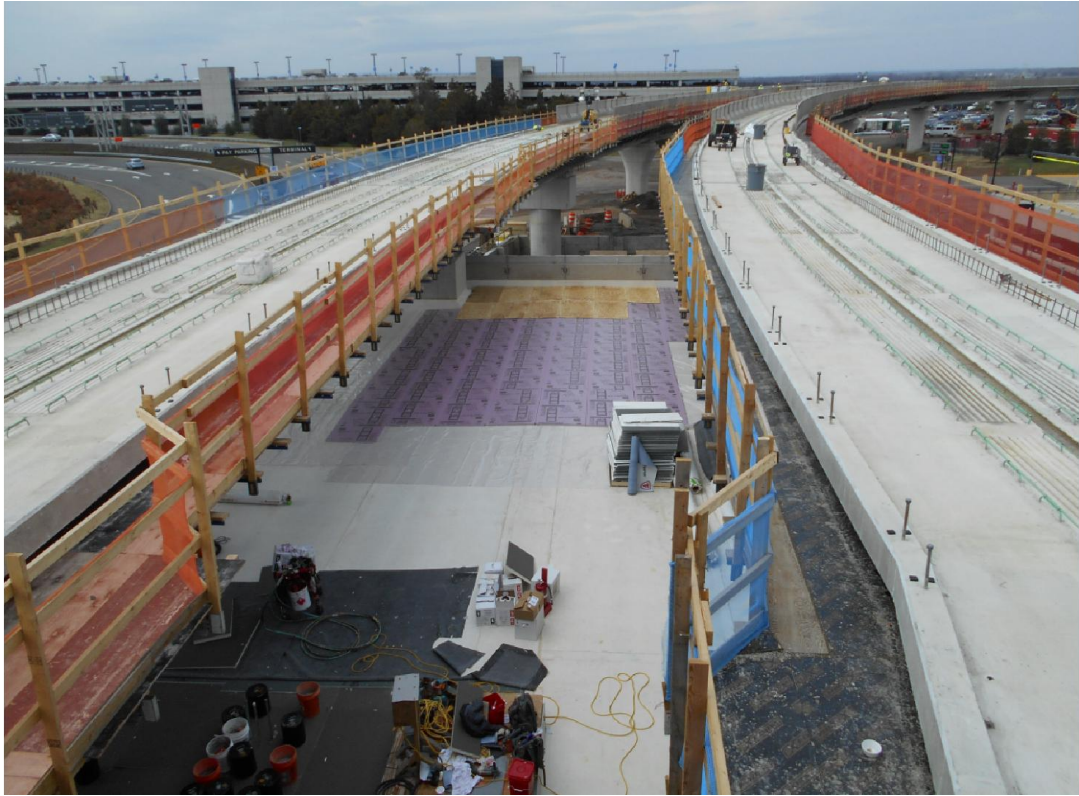
Prepare for Concrete Pours and Set Rails on Elevated Guideway