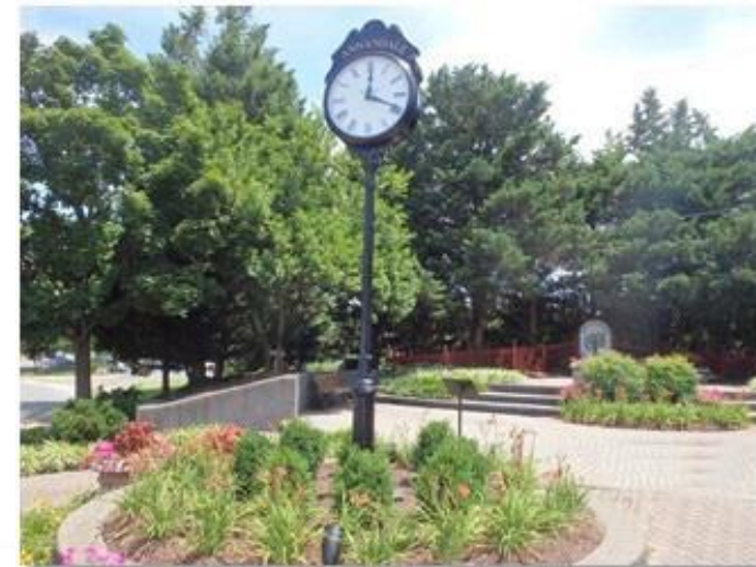
Annandale Tollhouse Park - After