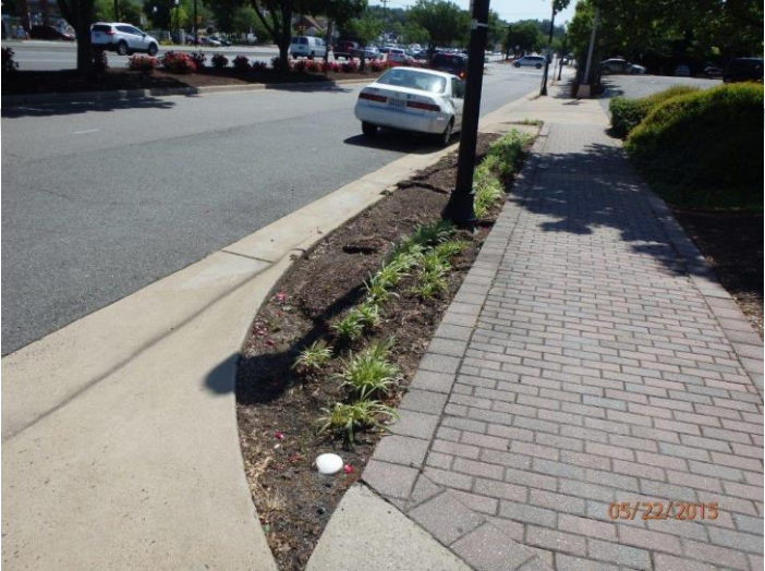
Before Annandale Service Drive