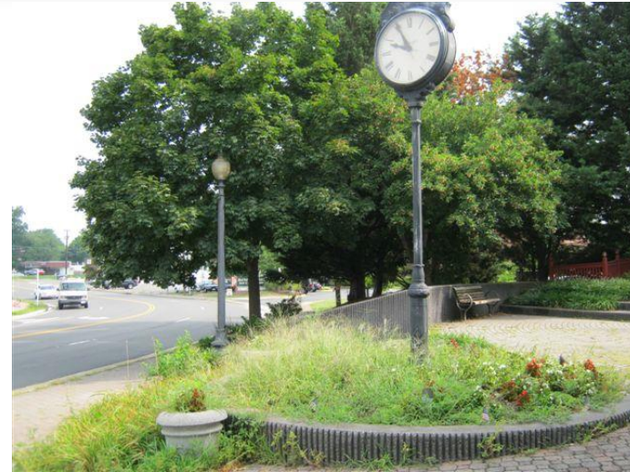
Annandale Tollhouse Park - Before