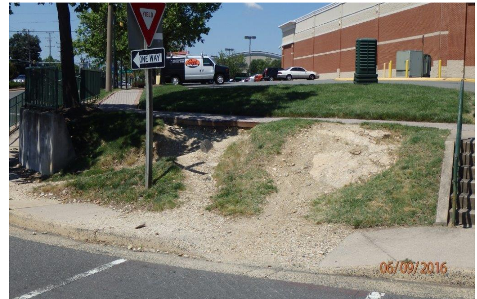
Bailey's Sidewalk Rehabilitation