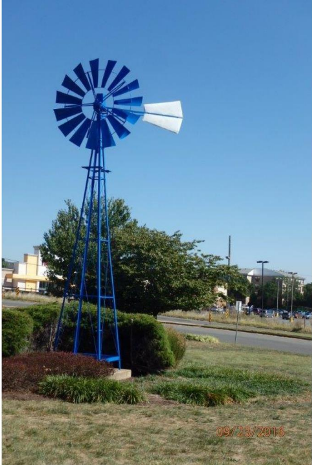
Bailey's Windmill - Before & After