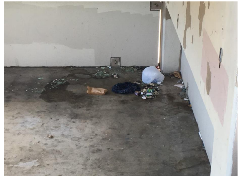
Seven Corners Pedestrian Bridge