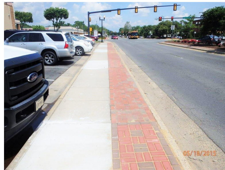
Springfield – Amherst Ave. Tree Box Removal – Before & After