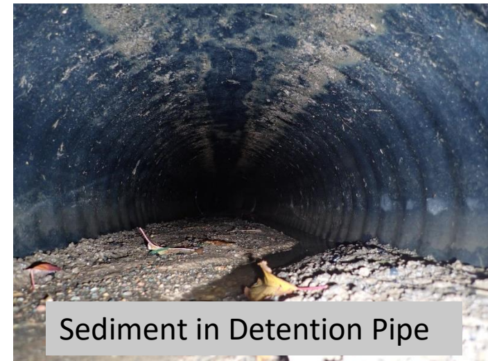
Sediment in Detention Pipe