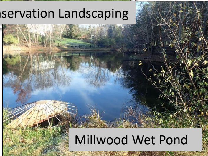
Millwood Wet Pond