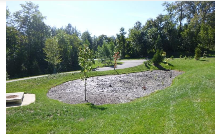
Bioretention Missing Mulch/Plants