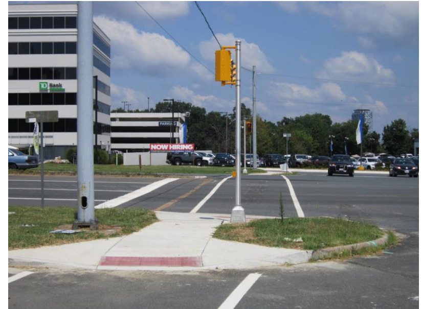
Route 123 at Boone Boulevard