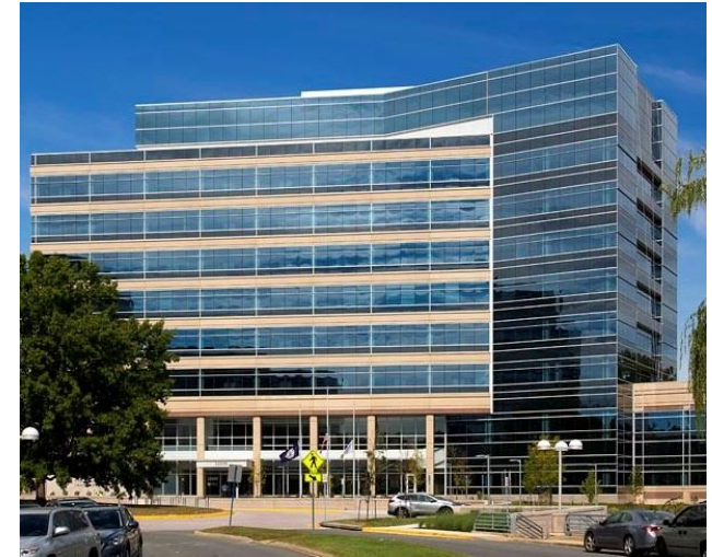
Public Safety Building