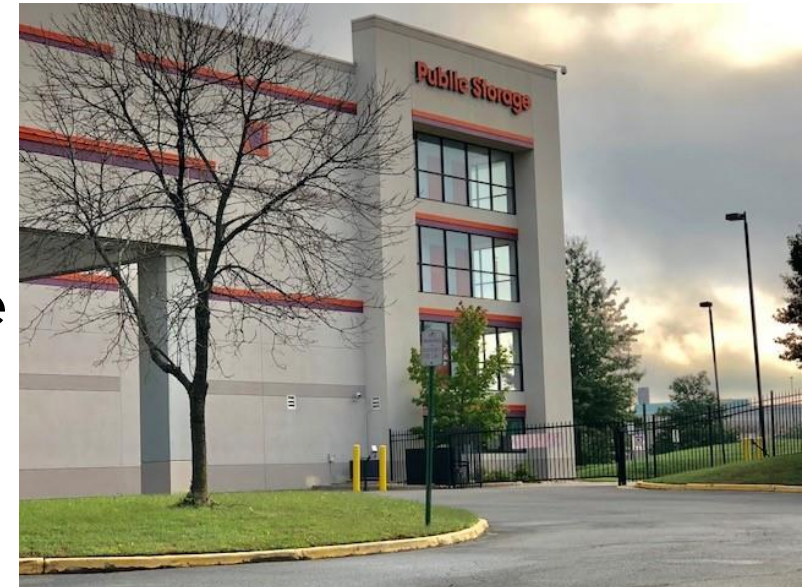
Self-Storage on Waples Mill Road