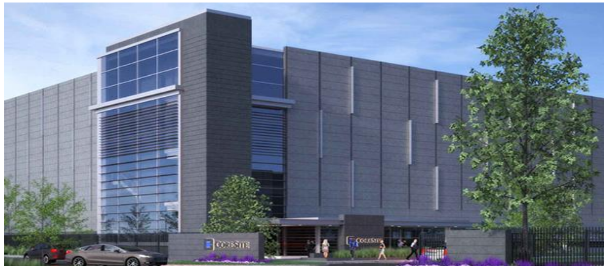
Coresite Realty Reston Data Center