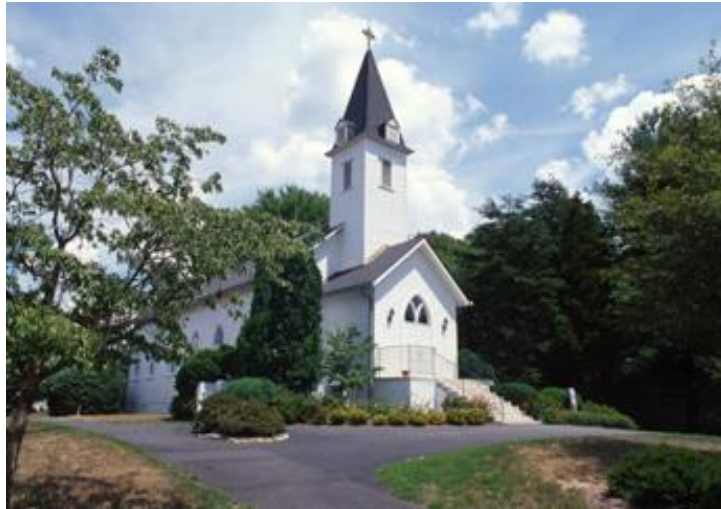
Wakefield Chapel in Annandale