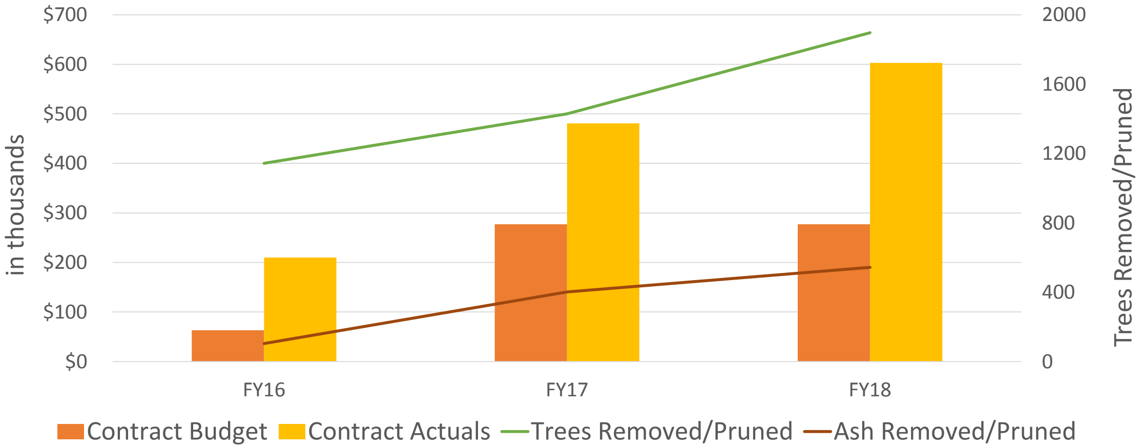
Forestry Contract Budget vs. Actual