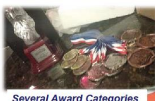
Several Award Categories