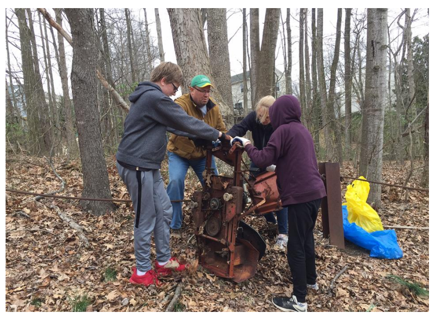
At Woodglen Lake, volunteers collected several bags of trash, the remains of an old television, and an old rusted riding lawn mower that took 4 volunteers to lift out of the woods.

Many civic, community and homeowner association volunteers, scouting groups, secondary school students, and individual volunteers gave their time to improve their community. Together, these individuals took great care of the natural resources we enjoy here in Braddock.