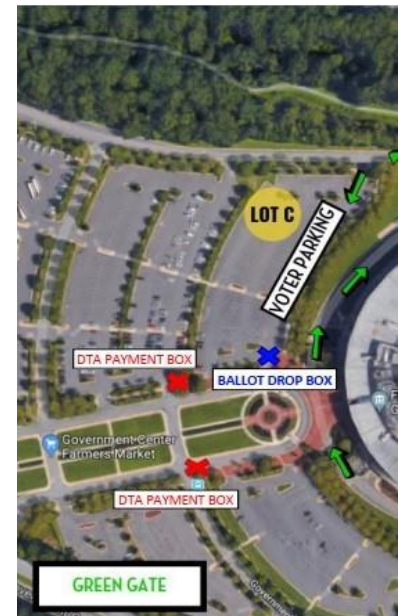
Government Center Map

Currently, there is a drop box at the Office of Elections at 12000 Government Center Parkway and outside of the Government Center (see map above for outside location). You do not have to wait in line to drop off your completed and sealed absentee ballot.