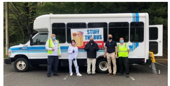
Supervisor Walkinshaw, Rep. Gerry Connolly, and the Stuff the Bus Team.

First, thank you for your incredible support of our Braddock District Stuff the Bus food drive locations. Thanks to your generosity, we collected 13,905 lbs. of food! That food is already on the shelves of ECHO's food pantry in Springfield and is helping our friends and neighbors make it through a difficult time. If you were not able to donate in person, you can still make a contribution online .