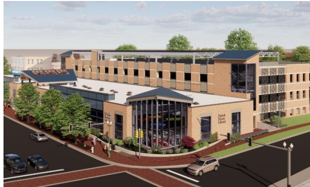
Patrick Henry Community Library & Garage-Partnership Project