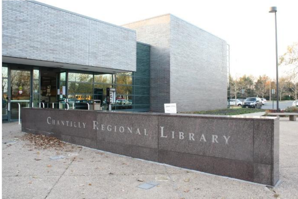
Chantilly Regional Library (Sully District)