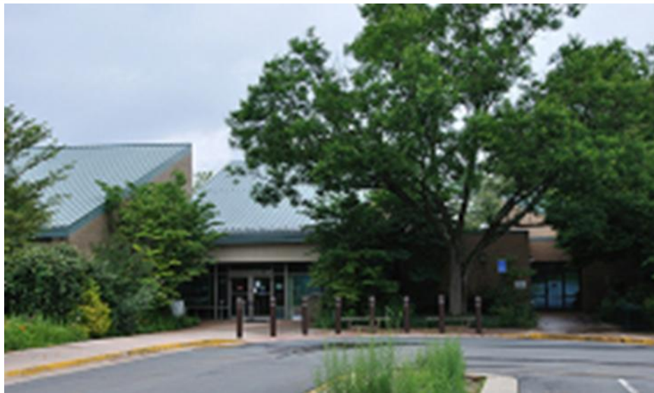
Kings Park Community Library (Braddock District)