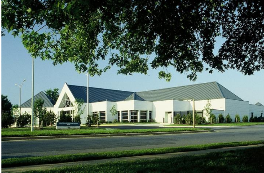
Centreville Regional Library (Sully District)