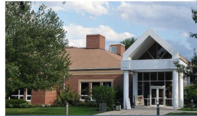
Sherwood Regional Library