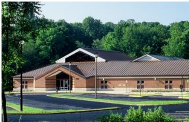
George Mason Regional Library