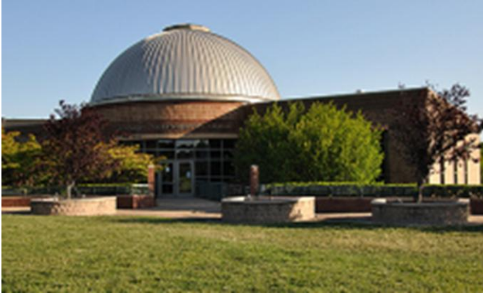
Herndon Fortnightly Community Library (Dranesville District)