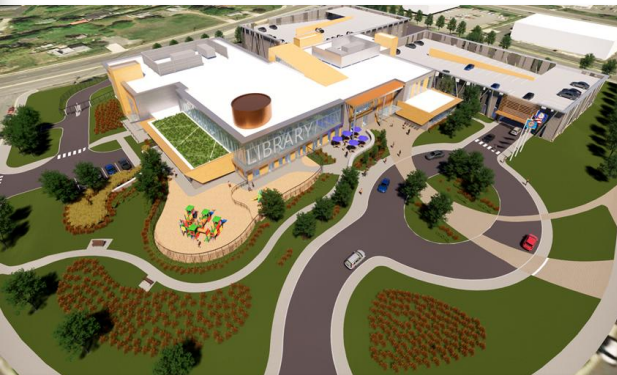
Kingstowne Regional Library- Collocated Facility