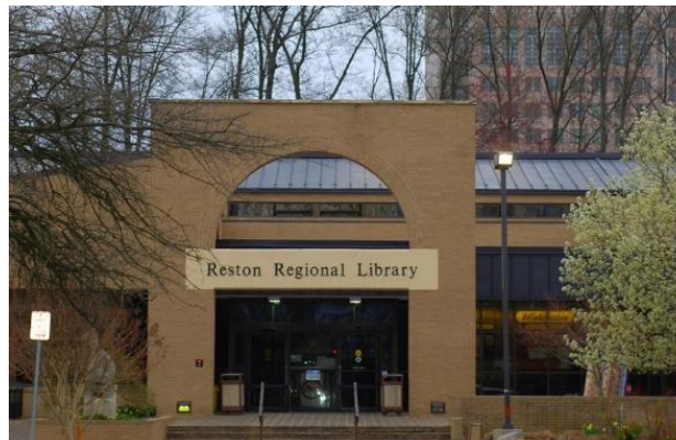
Reston Regional Library