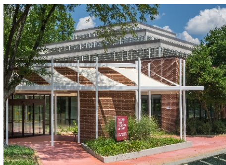
Tysons Pimmit Library Renovation

The Library Board of Trustees, whose members are appointed by the Board of Supervisors, the School Board and the City of Fairfax Council, are responsible for library policy. Planning is based on "Recommended Minimum Standards for Virginia Public Libraries," published by the Library of Virginia, which sets basic requirements for receiving supplemental State Aid. The priority of construction projects is based on many factors, including the