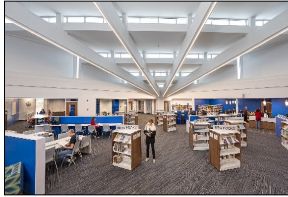
Pohick Library Renovation

Funding in the amount of $25 million was approved by the voters on November 6, 2012 to renovate Pohick Regional Library, Tysons-Pimmit Regional Library, John Marshall Community Library, and Reston Regional Library. The Pohick Library project is complete and the library opened to the public in January 2017. The Tysons Pimmit Library is also complete and re-opened in October 2017.