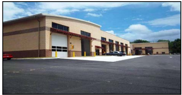
Newington DVS Facility