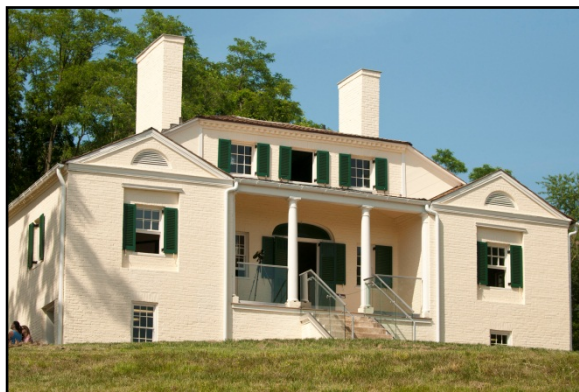
The Historic Huntley House