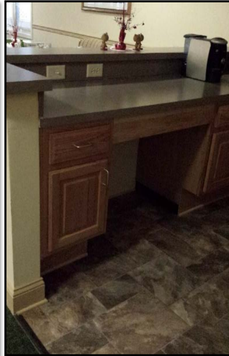
30" portion of the base cabinet was removed to allow for knee space.