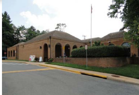
Patrick Henry Community Library