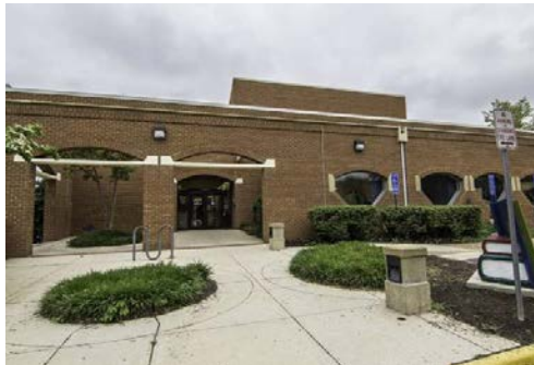
Lorton Community Library