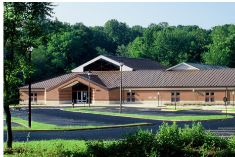
George Mason Regional Library