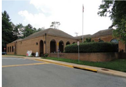
Patrick Henry Community Library