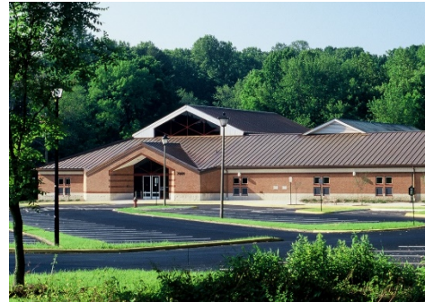
George Mason Regional Library