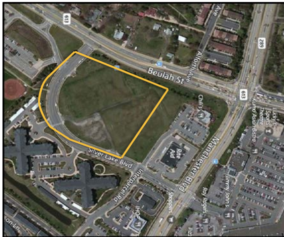
Kingstowne Site (6.74 acres) Beulah St. & Silver Lake Blvd.