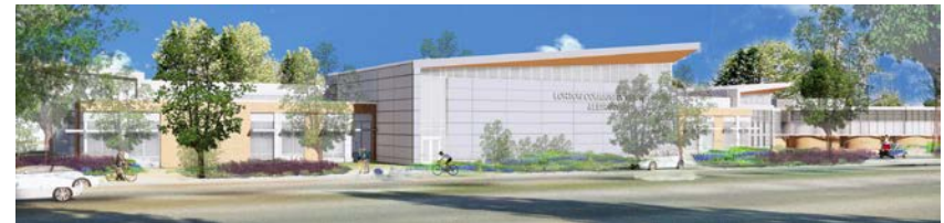
Elevation from Route 1