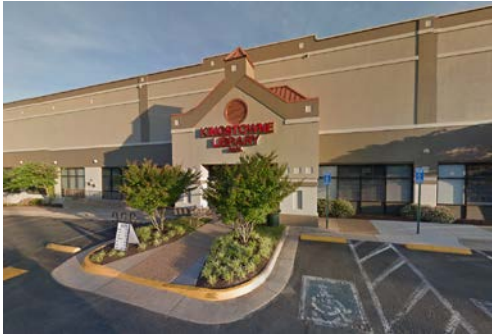
Kingstowne Regional Library