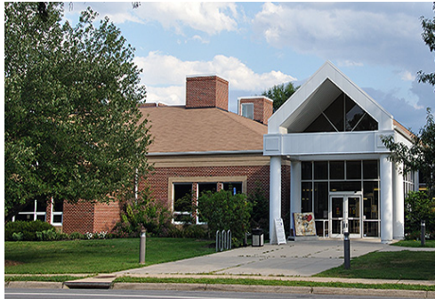
Sherwood Regional Library