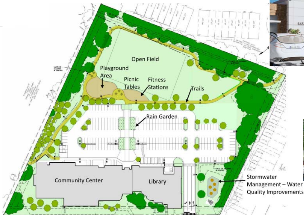
Proposed Site Plan – Currently in design