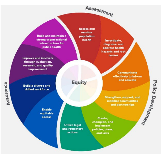
10 Essential Public Health Services

Communicable disease surveillance, prevention, and control are core public health activities, accomplished by a diverse team of staff across several divisions. Methods used to control the spread of communicable disease include testing and/or treating those exposed; immunizing whenever possible; improving infection control at health facilities; supporting social distancing between persons with a communicable disease and those who are well; identifying and decreasing high-risk behaviors or exposures; and preventing further spread through public education.