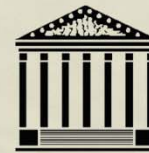
Exercising Corporate Stewardship