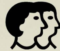
Creating a Culture of Engagement