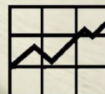
Maintaining Healthy Economies