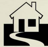
Building Livable Spaces