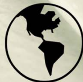
Practicing Environmental Stewardship