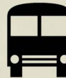
Connecting People and Places