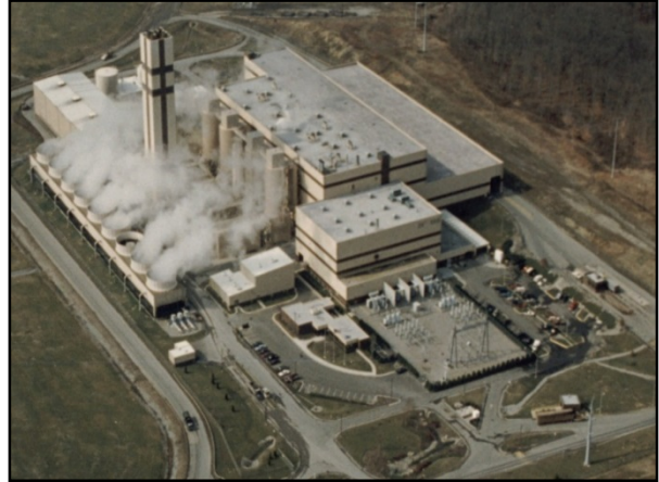
I-95 Energy/Resource Recovery Facility