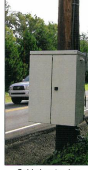
Cable box too low