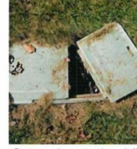
Open underground vault lid