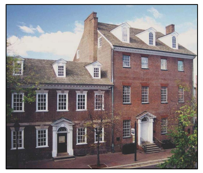
Gadsby's Tavern, Alexandria

Happy Holiday season! This month's edition of Found in the Archives completes our look at the world of 18<sup>th</sup> century ordinaries, focusing on the laws, and how they shaped tavern business in Fairfax County.