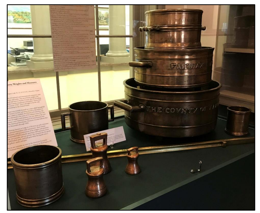
Fairfax County's Colonial Weights & Measures, Gift from King George II, 1744

The one exception to the application of the set rates was made for servants of the King, soldiers and 'Official