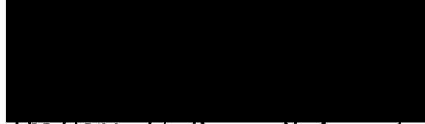
The Honorable Penney S. Azcarate CHIEF JUDGE

Compliance with Rule 1:13 requiring the endorsement of counsel of record is modified by the Court, in its discretion, to permit the submission of the following electronic signatures of counsel in lieu of an original endorsement or dispensing with endorsement.